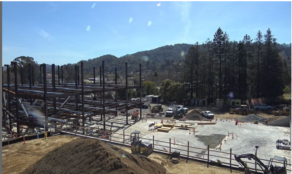
Learning Resources Center Steel Erection, Kentfield Campus

The District is partnering with Marin County Fire District on the design and construction of a facility that will support the Fire Foundry program. Meetings with the A/E firm, HGA are ongoing.