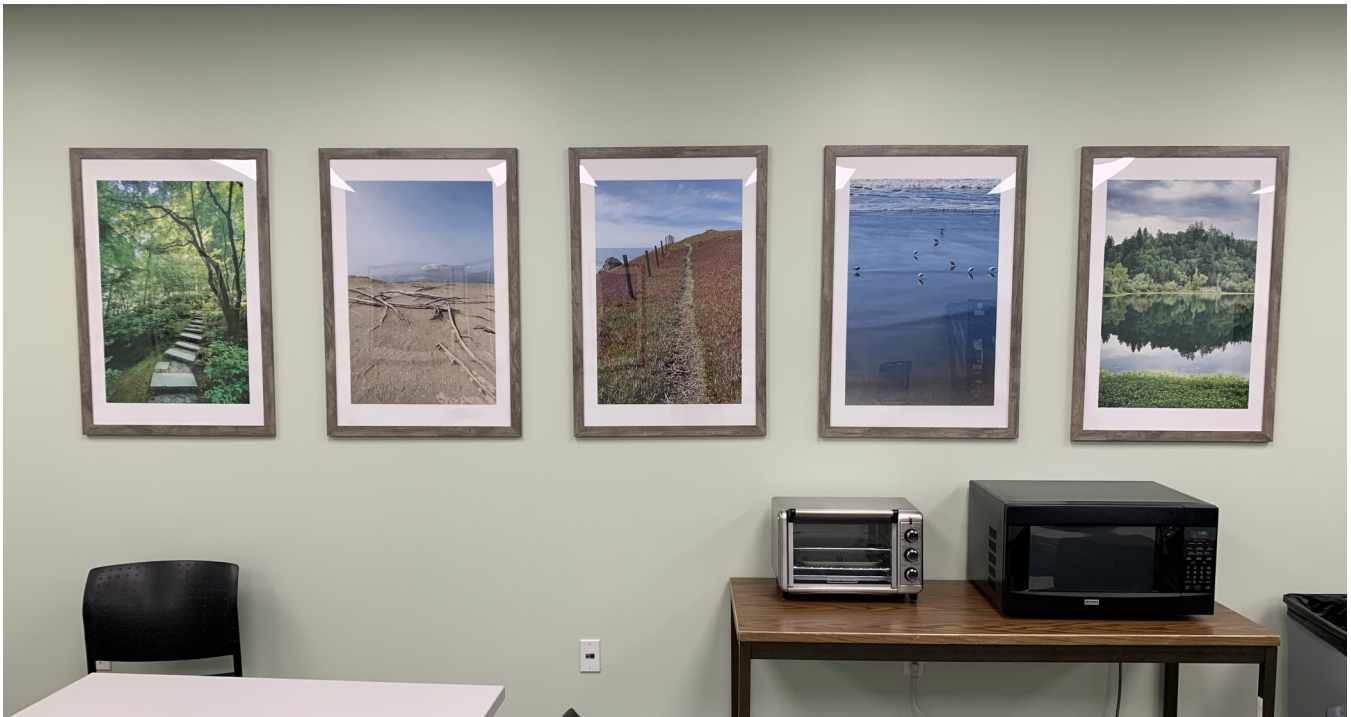
Staff and Faculty Breakroom, Indian Valley Campus