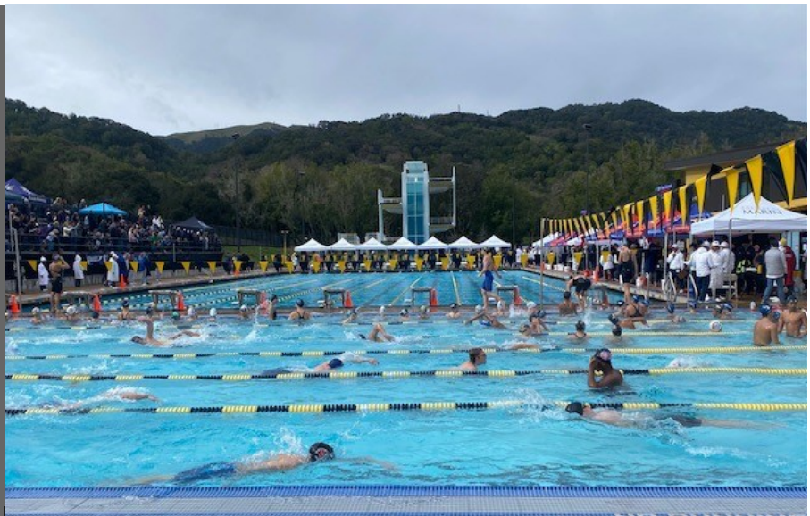
Speedo Sectionals Swim Meet, Miwok Aquatic & Fitness Center, Indian Valley Campus