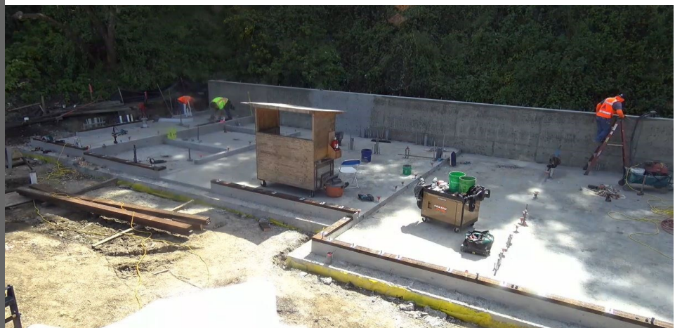
Bolinas Field Station Foundation, Bolinas

The foundation for the Field Station has been poured along with the retaining wall. These are two major milestones for this project. The exterior walls will begin to be framed in the coming weeks.