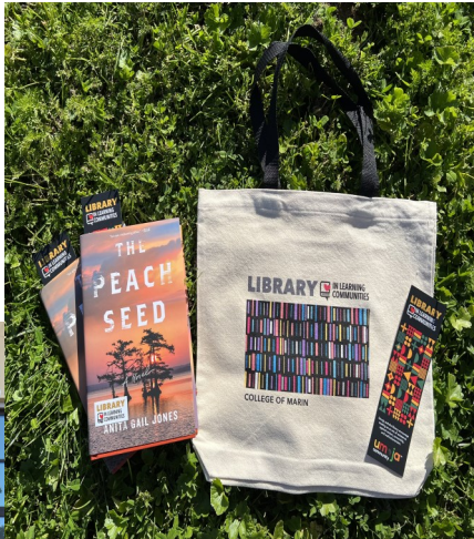
Library in Learning Communities Promotion

The COM Library initiated a campaign called "Library in Learning Communities."